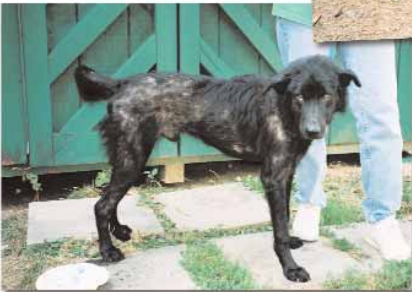
"I'll be back to my handsome self soon!"