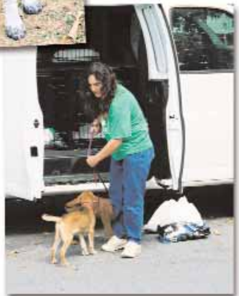
"I'm not getting in there again!"