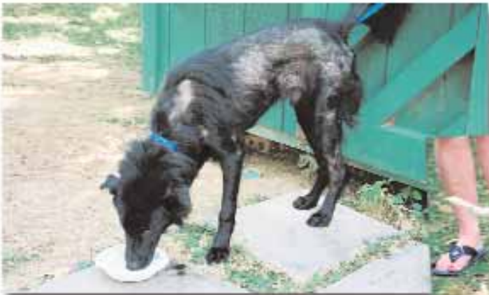
Jackson—"Free food, life is good again!"