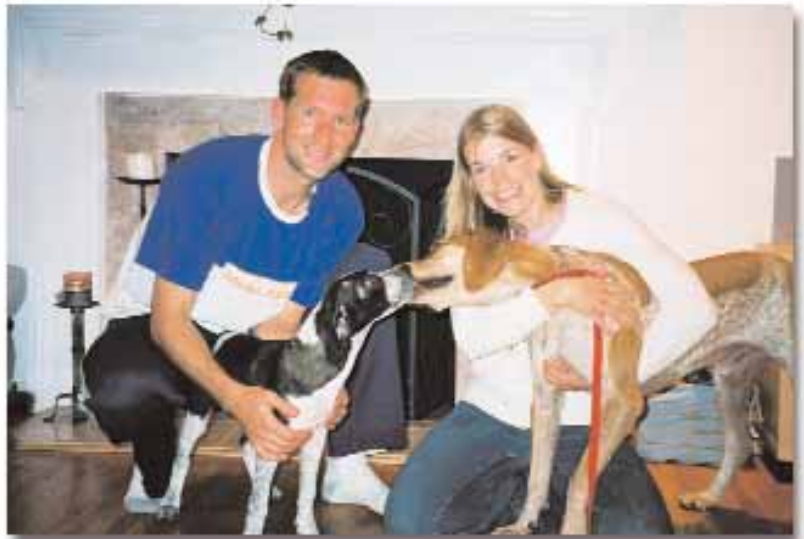
Heidi loves her new family.

Lucky dogs Louise, Anna and Heidi have been adopted and are living the life they deserve.