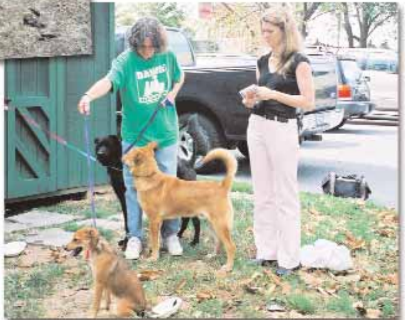
Gazette reporter meeting our new dogs soon after they arrive in Maryland.