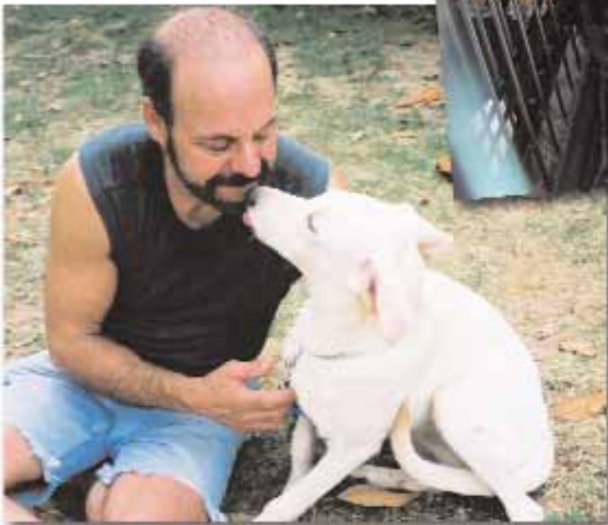
A kiss from from our happy girl Delta!