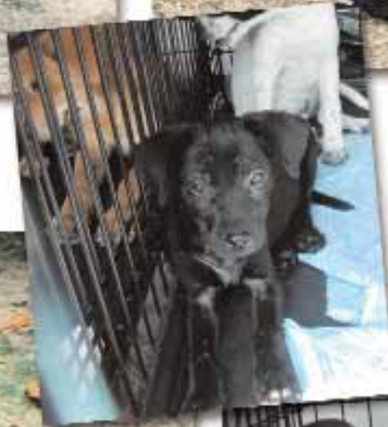
Beau (left), Jazz and Julep (below)