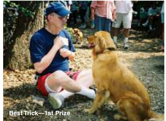
Best Trick—1st Prize