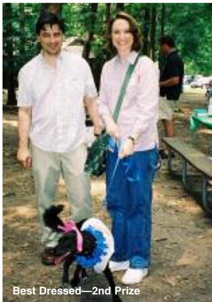
Best Dressed—2nd Prize