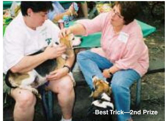
Best Trick—2nd Prize