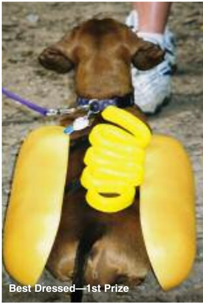
Best Dressed—1st Prize