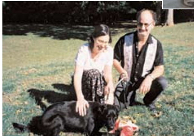
Adopted DAWG dogs of all sizes, from Beau, Camrie, Scampi and Oscar, to Cissy, Sebastian and Barkley!