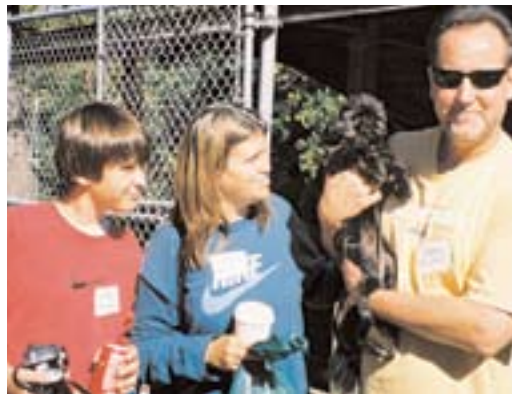
DAWG dogs Dolly, Mandy (Lollipop), Tonka, Max, Daytona, Tink and Mulligan, and Betsy and Bethany plotting to get those hot dogs off the table!