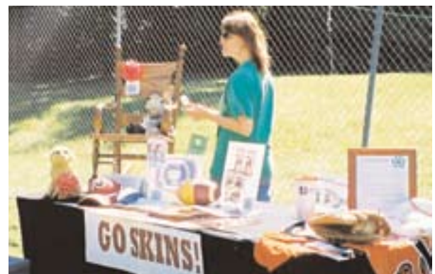
Deedee, Slinky, Oliver in pure bliss, and lots of generous donations to entice bidders at our silent auction!